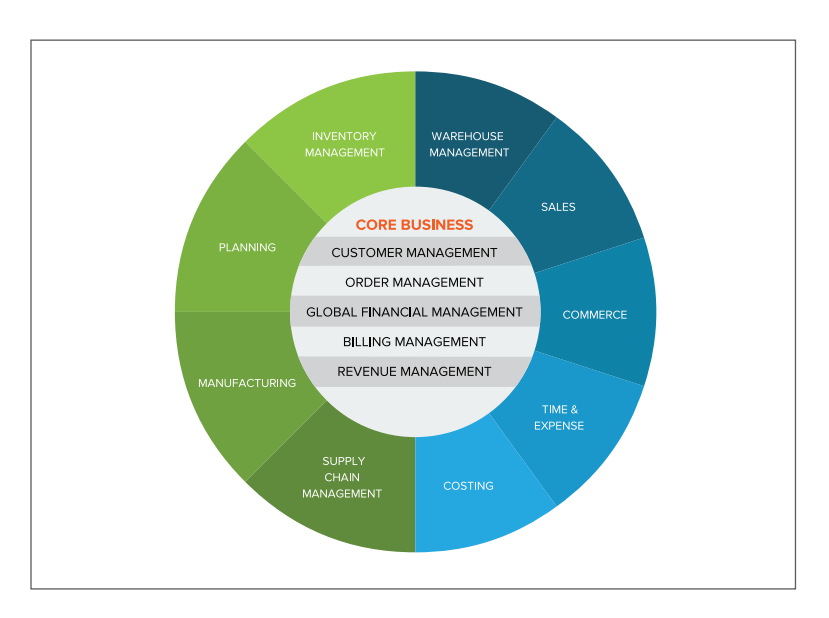
Figure 1: NetSuite provides a full business solution for manufacturers.

Since it's a cloud-based application, manufacturers can benefit from NetSuite's rich functionality immediately, and at lower upfront costs, than legacy approaches.